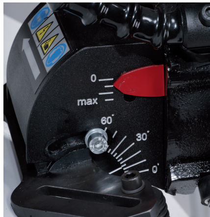
Continuous angle adjustment from 0 to 60 degrees.