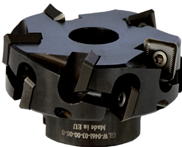
Mono block milling head, with 10 indexable inserts fixed with screws.