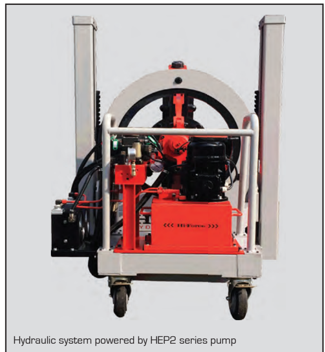
Hydraulic system powered by HEP2 series pump